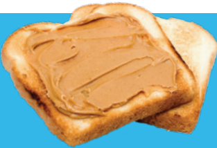
Whole wheat toast and peanut butter