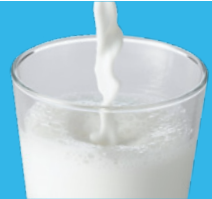
Lowfat (1%) or fat-free milk