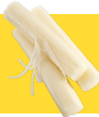
Lowfat string cheese