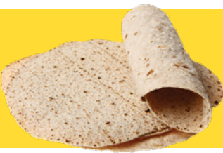
Whole wheat tortilla